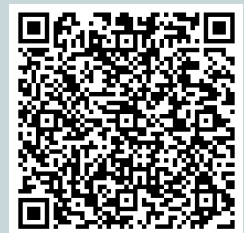
Impacts of Municipal Investments in Afterschool