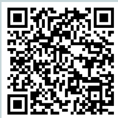
Overview of Afterschool Programs In Utah

Scan the QR codes below to learn more about afterschool programs in Utah, their impacts on youth and communities, and additional national studies on their need.