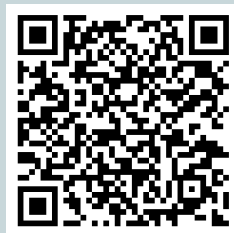
Afterschool Alliance America After 3 Report