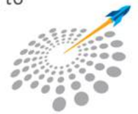
MILLION GIRLS MOONSHOT

Million Girls Moonshot is a initiative designed to increase diversity and equity in STEM by engaging 1 million girls across the United States in high-quality, innovative afterschool learning opportunities. UAN partners with Utah State University (USU) Extension to create more equitable and inclusive engagement for girls in STEM by implementing transformative programming.